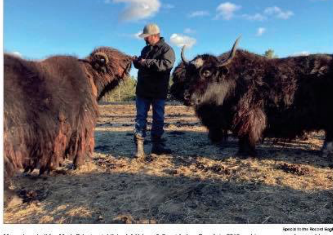
Mancelona, Michigan Mancelona, Michigan Mancelona, Michigan